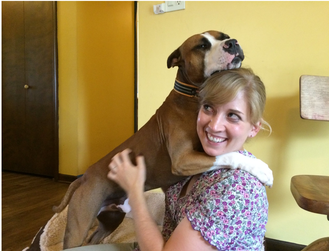
Canine victim of cruelty meeting new friend