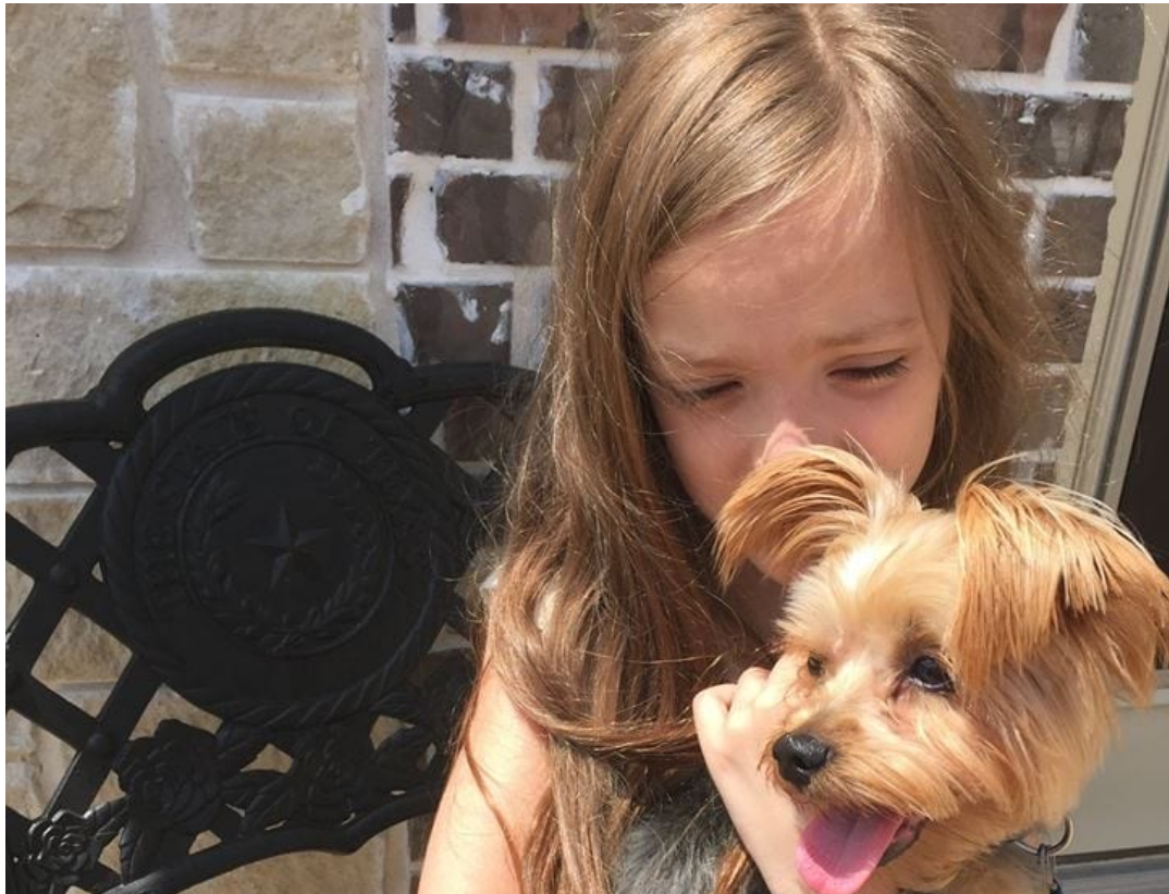
One of the Forever Homes dogs