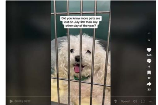
Video from Animal Care Center of NYC